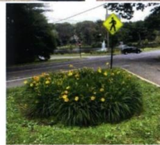
BEECHMONT IN THE SPRING