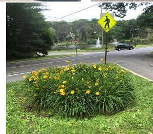
BEECHMONT IN THE SPRING